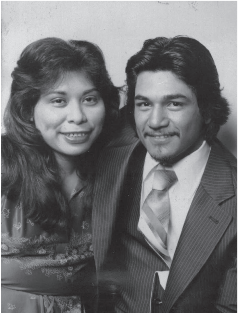
This is my mom and my dad. This picture was actually taken in 1980 by Sears. The photographer went to the apartment to take the picture.