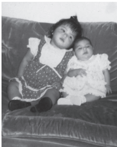
This my cousin and me. Im the one in the white dress. I am the youngest of the four older female cousins.