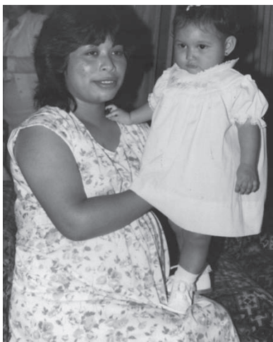
This is my mom with my sister. My mom is pregnant with me.