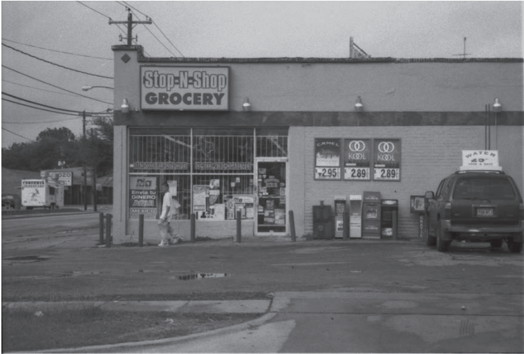
This Stop-N-Shop Grocery store is right across my aunt's house. This picture is interesting because it was cloudy when I took it.